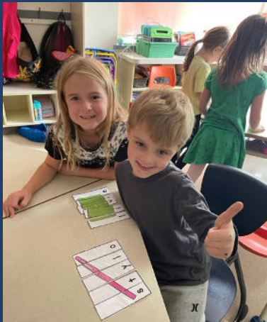
Our Lady of Lourdes students learning french words