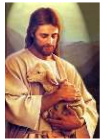
Jesus and the Lost Lamb

Jesus, my Lord, I give you my heart To be your home forever. Your peace and joy Will be my strength For all our life together. Amen.