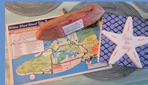
The boat that was found by a family on Hilton Head Island