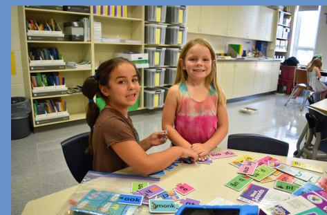
George Vanier students enjoying indoor recess during the September heat wave!