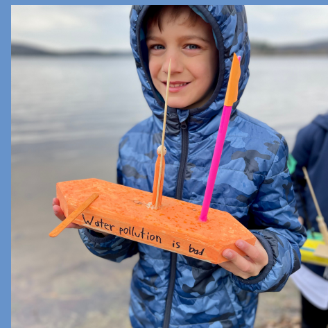
St. John Bosco student proudly launching their boat into the Madawaska River