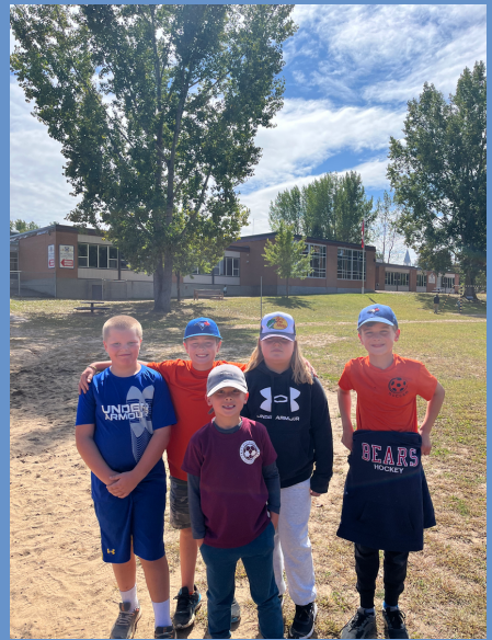
St. Andrew's Summer Sports Day

Finally, many schools are training in preparation for the annual Partridge Run in Barry's Bay on October 5th. Schools from across the RCCDSB and RCDSB join in on this day and run the course around Barry's Bay. A great day to meet friends and get some exercise during the beautiful fall months.