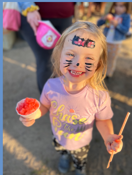
St. Andrew's Fun Fair!