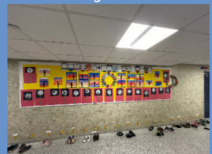
Remembrance Day Artwork at St. John XXIII