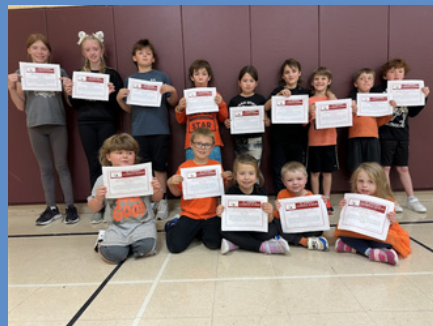
Super Student Awards St Joseph's Calabogie