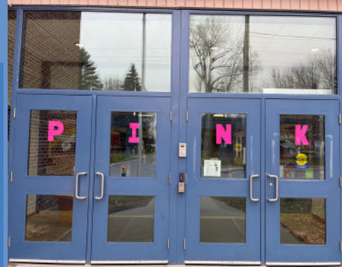
St. Joseph's Arnprior PINK week!