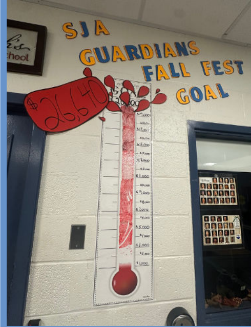
St. Joseph's Arnprior surpassing their Fall Fest goal!

Schools across RCCDSB continue to nurture its students' academic, social, and spiritual growth through these enriching programs and events.