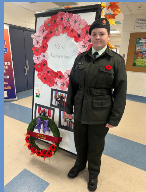
Remembrance Day St. Joseph's Arnprior