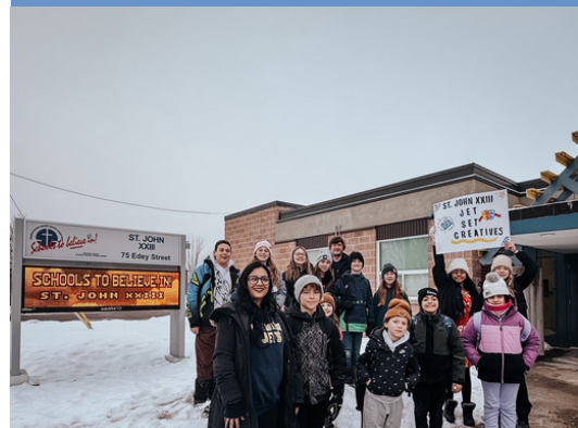
Destination Imagination Team