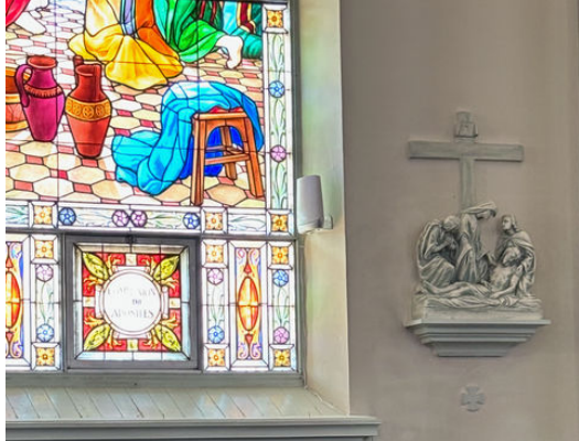
Stations of the Cross at St. John Chrysostom Parish

The transition into the Lenten season was marked by both celebration and solemnity. The school community kicked things off with a delicious Shrove Tuesday treat, courtesy of the dedicated School Council, before entering a period of reflection with a beautiful Ash Wednesday liturgy.