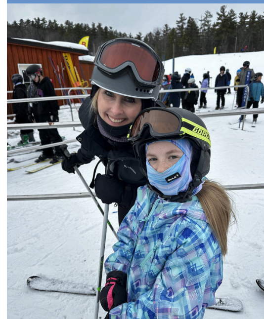
Skiing at Mount Pakenham