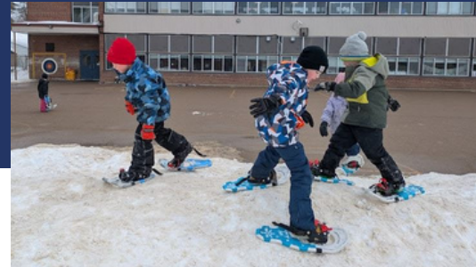
Snowshoeing at the Grove