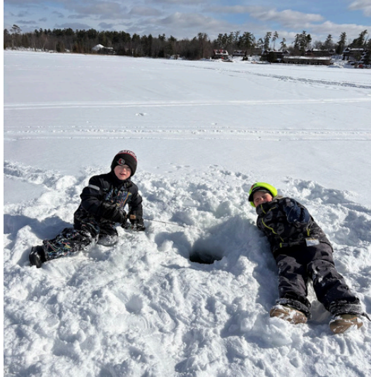
Ice Fishing on Calabogie Lake!