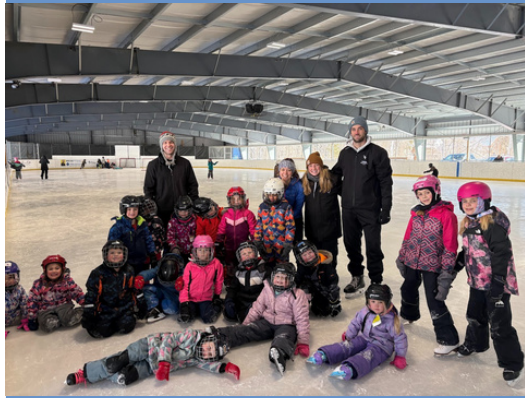
Skating at Dan O'Neil Arena