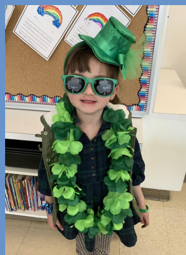
Cathedral Irish Spirit Day!