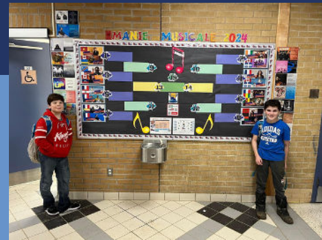
Manie Musicale at Our Lady of Lourdes

Finally, Grade 6 students attended the Grade 7 orientation at Bishop Smith on March 21st. Students toured the school and learned about what opportunities are available to them during their transition to high school, including a visit to the transportation, music, and healthcare classes, and they even baked cookies in the hospitality room! A big thank you to the students at Bishop Smith for welcoming the newest learners to high school!