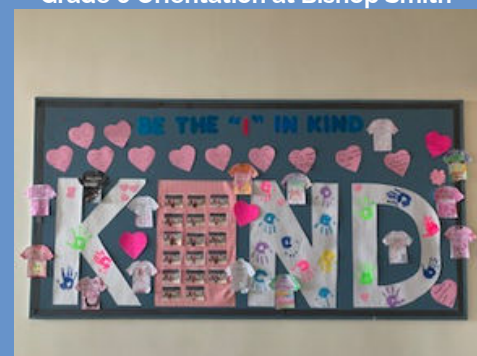
Kindness Week at Holy Name