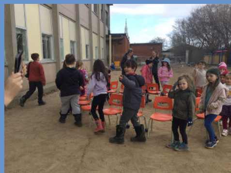
Holy Name Winter Carnival