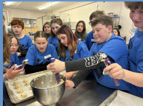
Grade 6 Orientation at Bishop Smith