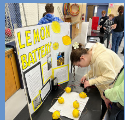
Science Fair at Our Lady of Lourdes