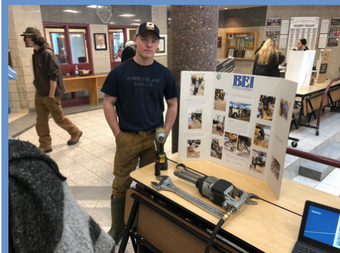
St. Joseph's Career Fair