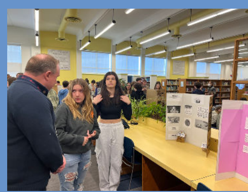
Entrepreneurship Event at Bishop Smith