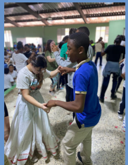
The Dominican Republic Experience 2024