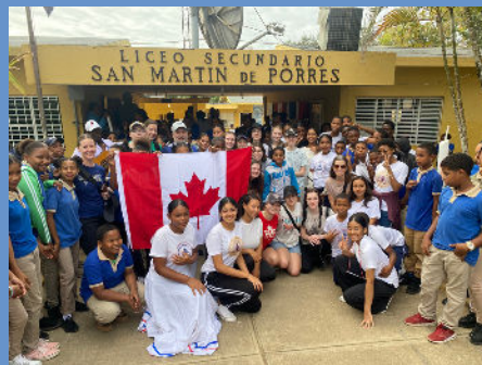
The Dominican Republic Experience 2024