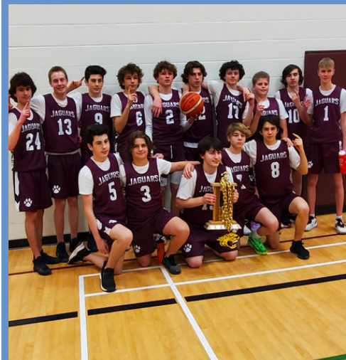
St. Joseph's Junior Boys' Basketball team