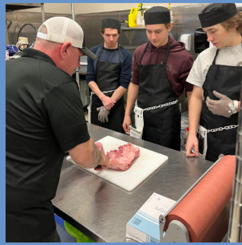
Meat Cutting Workshop

As you can see, the secondary schools have been bustling with activities. The Board looks forward to seeing what's to come for the remainder of the 2023-24 school year!