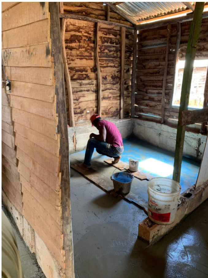
Working on painting homes and pouring concrete floors