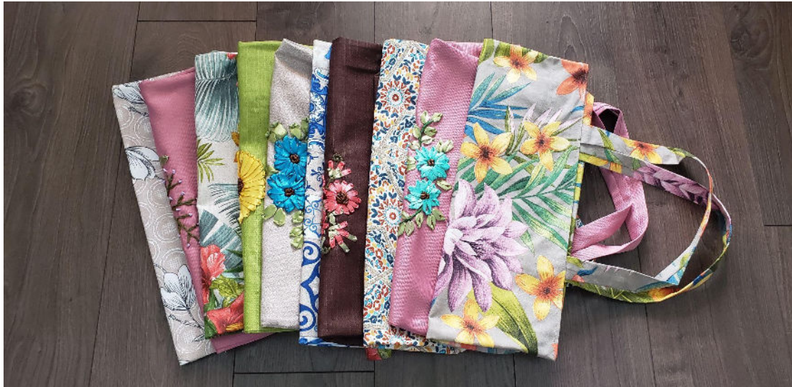
Bags for the EOCCC