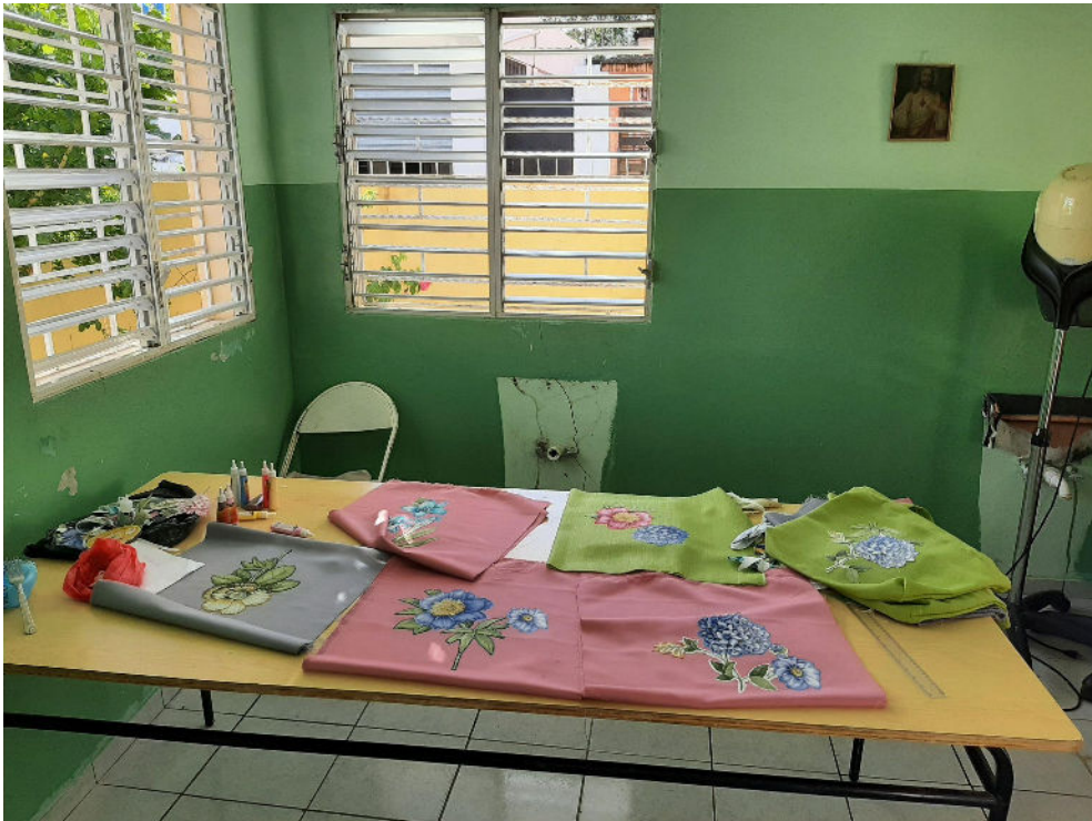
Bags for the EOCCC