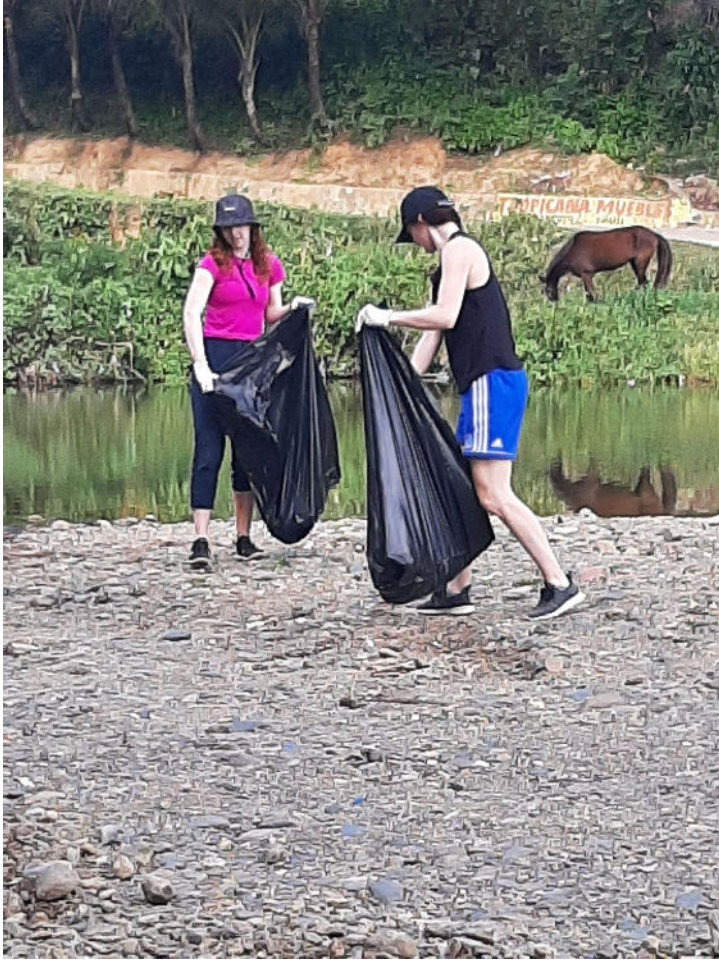
Cleaning the Ozama River